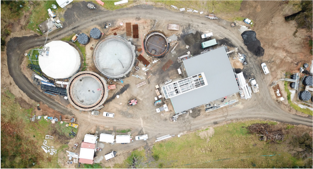
Brogo Bermagui Water Treatment Plant, NSW