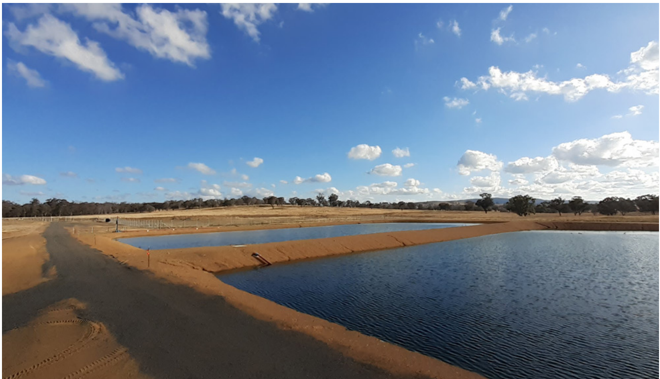
Bundarra Sewerage Treatment Plant, NSW

Providing funding to allow local water utilities to complete strategic plans, which ensures regional town water supply and sewerage infrastructure is successfully developed and managed.