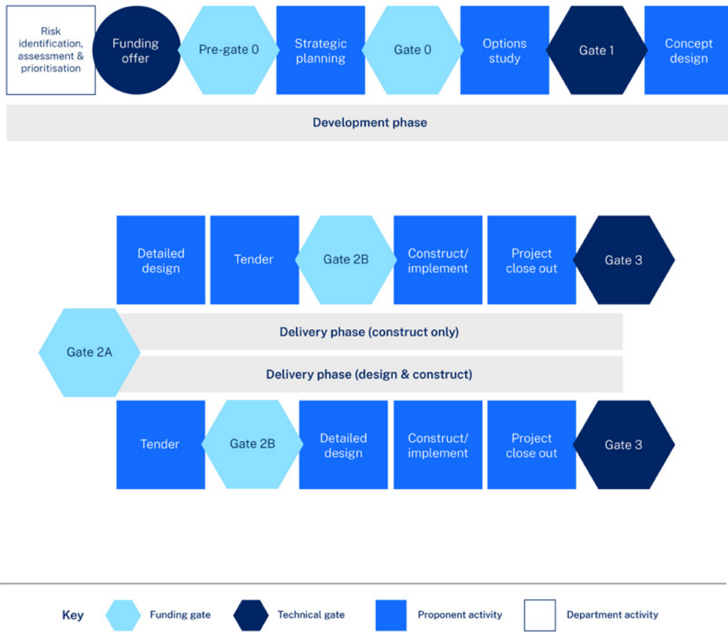
Figure 1 – Stream 1 grant lifecycle