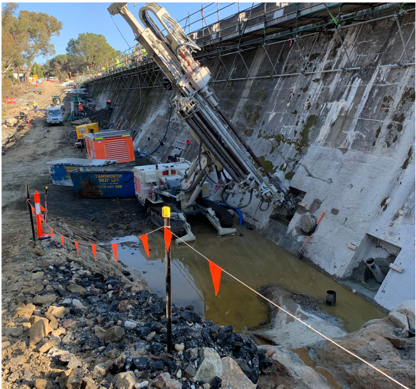
Dumaresq Dam, NSW

Stream 3 is now closed. The department administers existing projects in line with existing funding agreements and assessment frameworks.