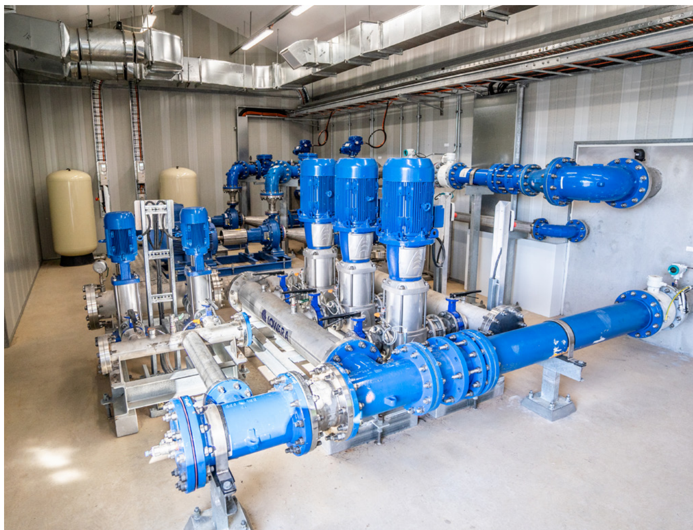
Yass to Murrumbateman Water Transfer Pump Station, NSW

Funding agreement templates are available on the program website .