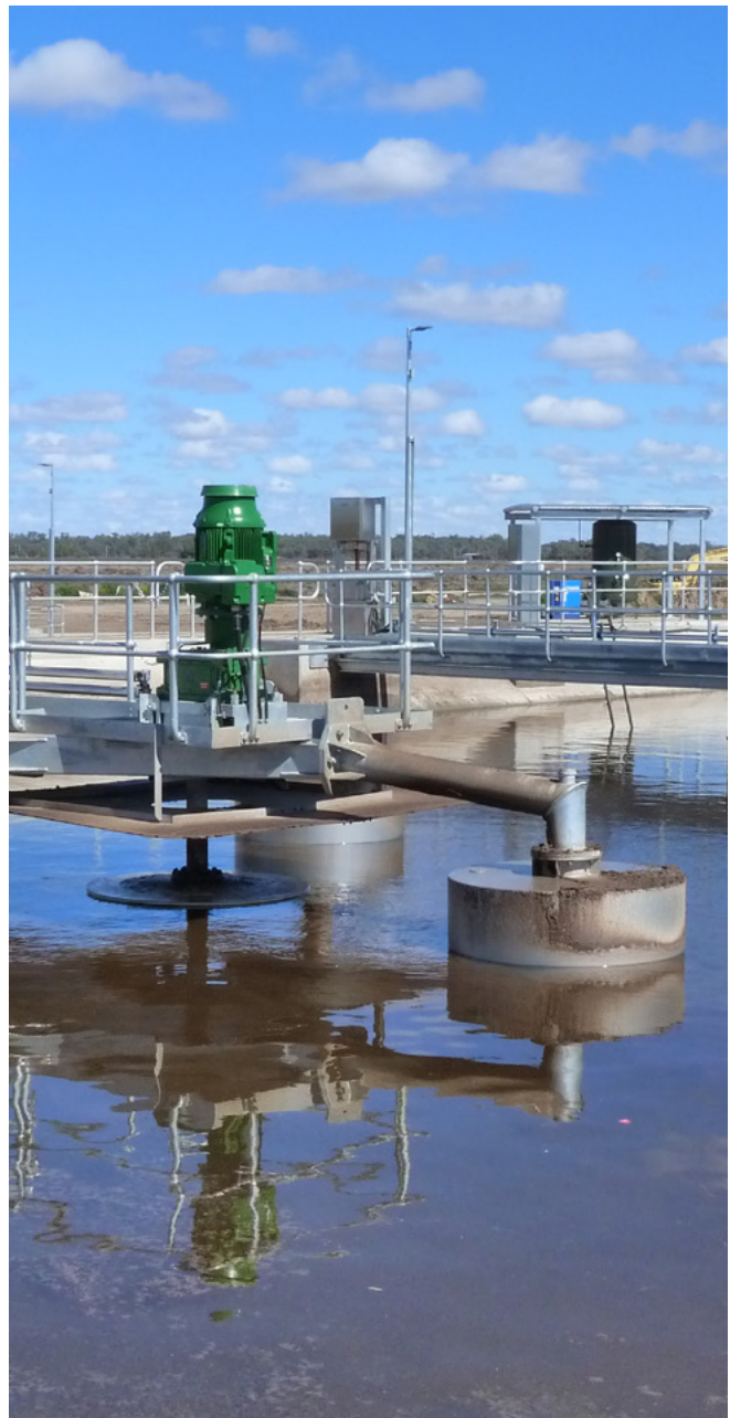
Hay Sewerage Treatment Plant, NSW

Stream 3 opened in October 2018 and is now closed.