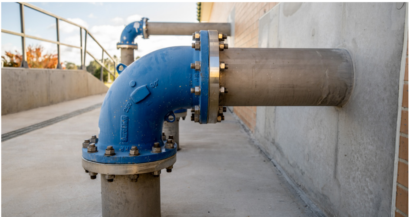
Yass to Murrumbateman Water Transfer Pump Station, NSW (external Western wall)