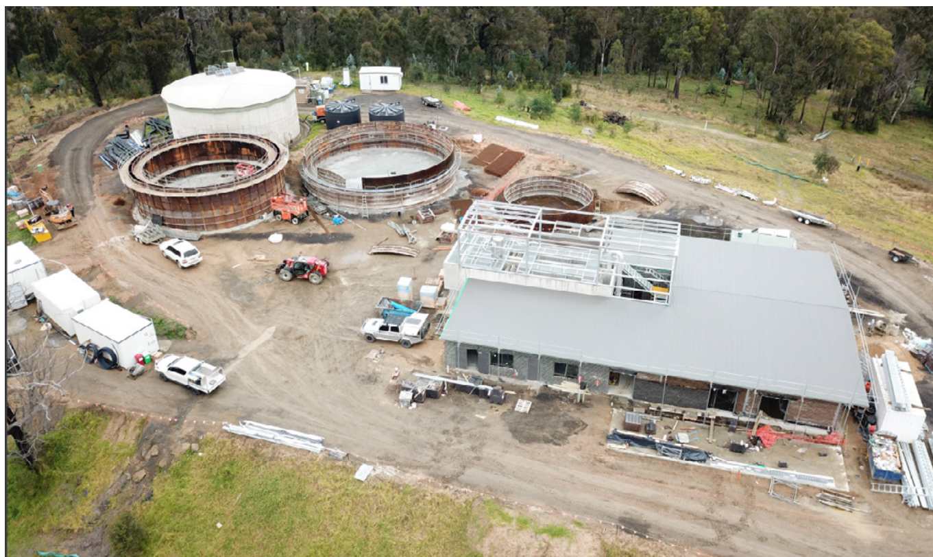
Brogo Bermagui Water Treatment Plant, NSW

Further detail on each assessment criterion are available on the program website .