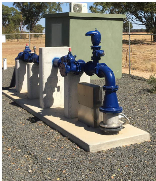
Bores in Trangie, NSW.

Funding agreement templates are available on the program website .