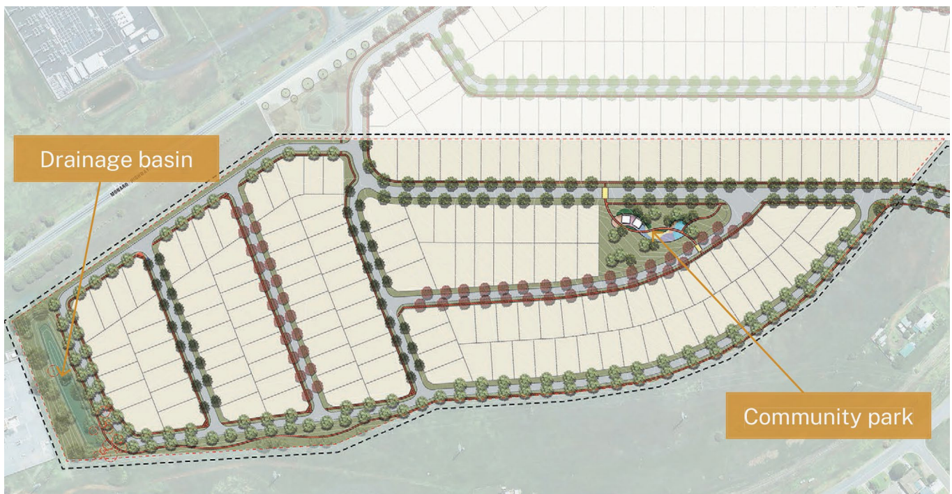
Draft Masterplan of the South Precinct

On behalf of Merrimans, LAHC has prepared a masterplan and Development Application (DA) for the South Precinct and has targeted to lodge it with Snowy Monaro Regional Council in the coming weeks.