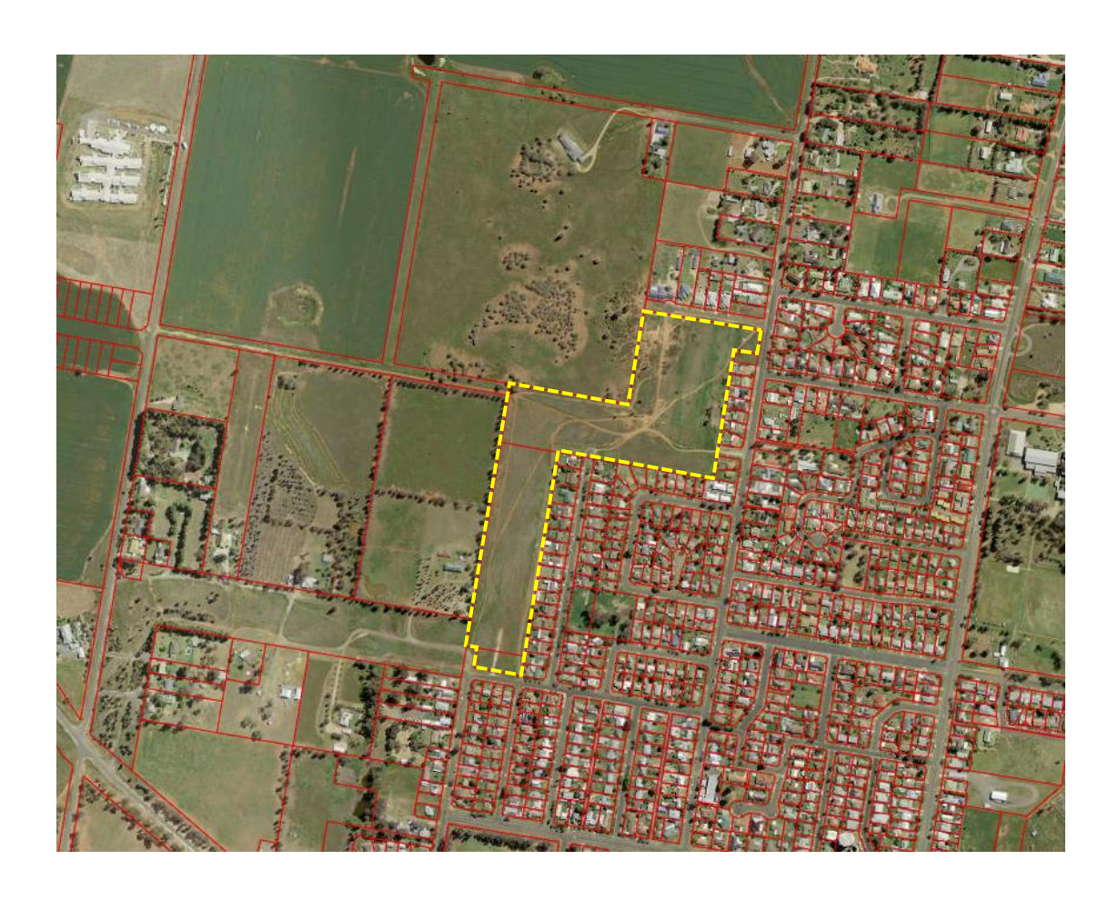
Figure 02: Eplanning portal Bushfire Prone Land Map