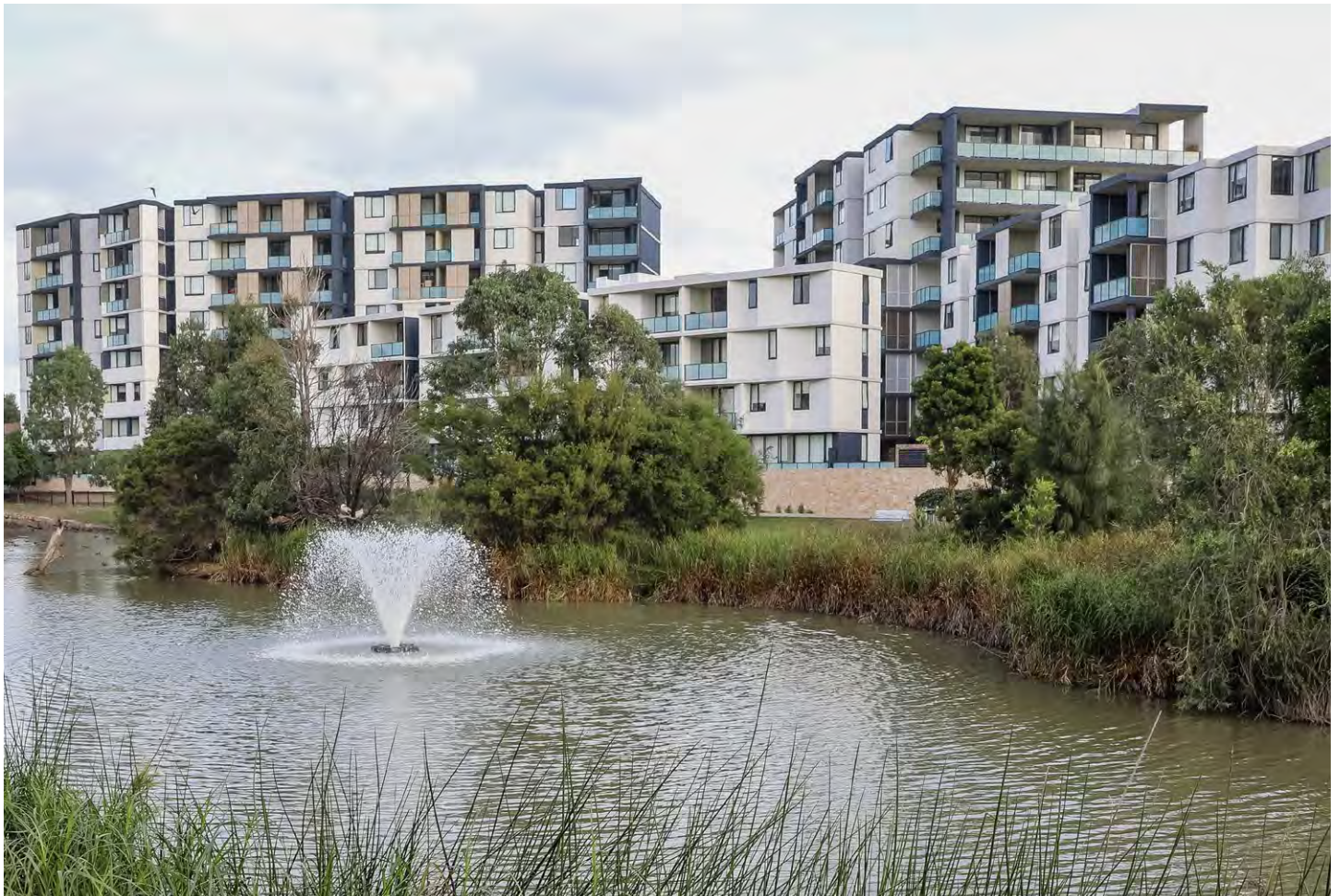
Image: Washington Park, Riverwood

The rezoning process for the new focus area will build on the previous renewal work completed at Washington Park in 2017, which transformed mostly old social housing dwellings into a modern, integrated mixed-tenure community.