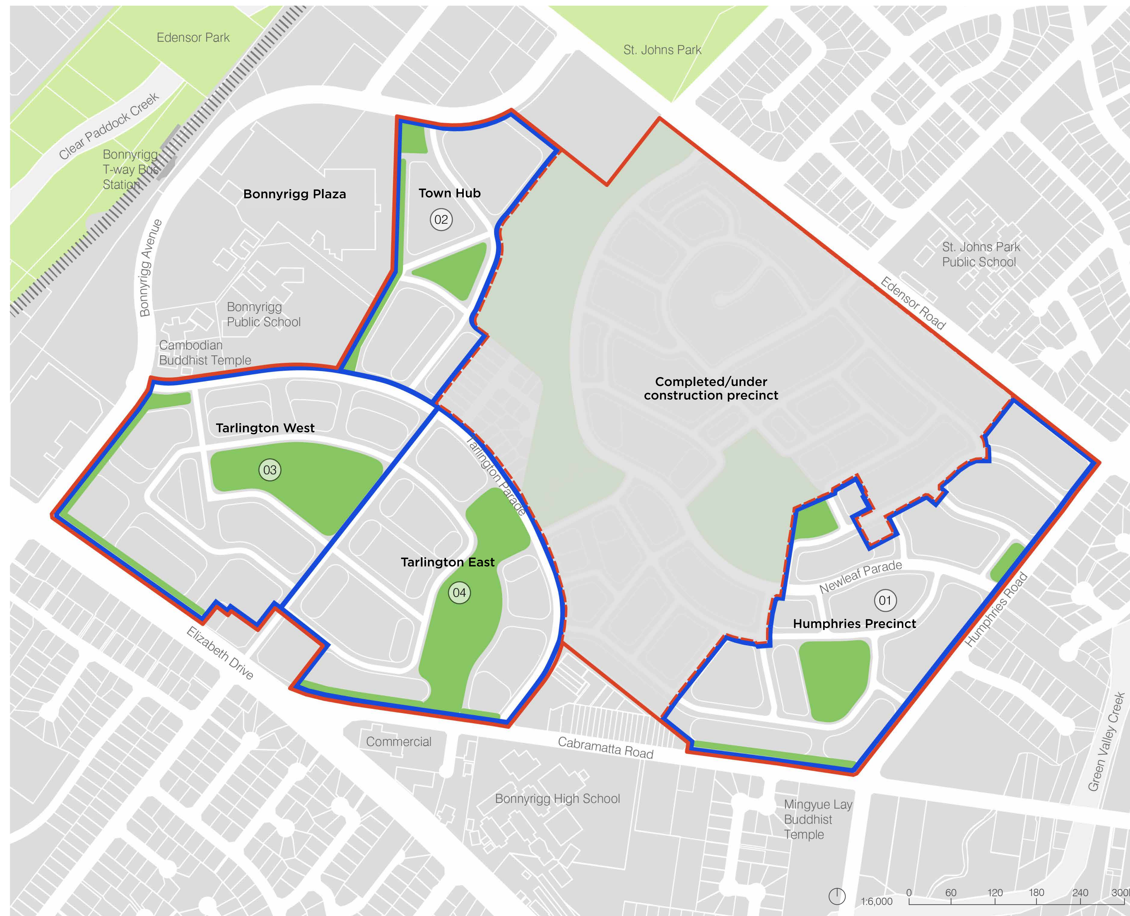
Map of character precincts.

Increased community, services and retail spaces to meet residents' everyday needs.